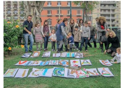
S.E.R.R. (Naples, Italy) European project for waste reduction Italian and European award in the "Business & Industry" category

Sustainability and integrity are embedded in our culture. They drive continuous improvement across the Augustea companies and are central to our mission of growth and development, aimed at generating and distributing value to meet customer needs, ensure shareholders' returns, and support the competitiveness of the countries where Augustea operates.