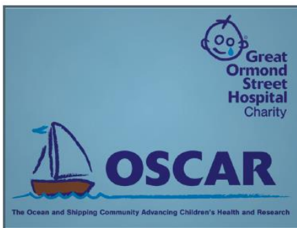
The Great Ormond Street Hospital (London, UK) the Shipping Community raises funds for one of the world's leading children's hospitals (Oscar Campaign)

Those who manage a company hold responsibilities not only towards their direct stakeholders but also towards the environment in which their business operates. For this reason, Augustea embraces the principles of social responsibility as key drivers of a sustainable approach to engaging with local communities and addressing major social challenges.