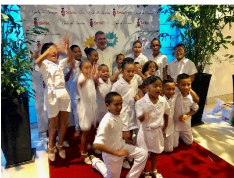
Fábrica de Sonrisas (Barranquilla, Colombia) Centre of surgery reconstruction for children affected by harelip

In recent years, our commitment has focused on healthcare; educational grants for underprivileged individuals; support for vulnerable and marginalized people; humanitarian relief efforts; national trusts dedicated to preserving the artistic and natural heritage of the countries where we operate; and, above all, on children.